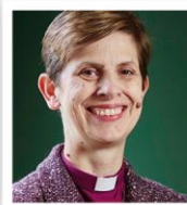
BISHOP LIBBY LANE